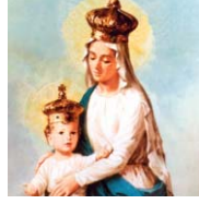
Our Lady of Victory