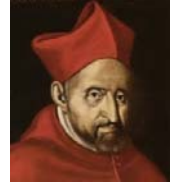
St. Robert Bellarmine